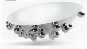
↓ LANDSCAPE Patricia Urquiola's dinnerware for Rosenthal merges Western culture with the traditions of the Orient. The designer's highly tactile patterns give the pieces an extra dimension, which highlights the quality of the lustrous, water-tight porcelain. ROSENTHAL • www.rosenthal.de